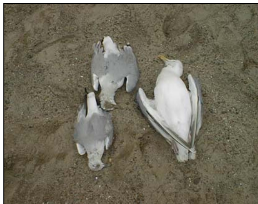
Figure 2. Dead gulls due to botulism

C. botulinum can be found in wetlands and lakes and often exists in a spore form that is resistant to heat and drying. In some instances the bacteria may remain viable for years. The production of toxin occurs during multiplication of the vegetative form of the bacteria following spore germination. The vegetative form requires dead organic matter and a complete absence of oxygen (anaerobic) to grow and produce the toxin.