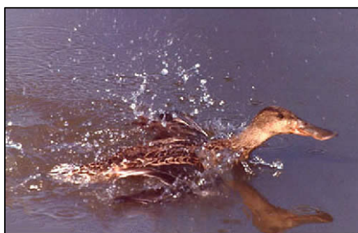
Figure 4. An intoxicated bird propelling itself across the water with its wings

Botulism affects the peripheral nerves of the bird and results in paralysis of the voluntary muscles. This results in an inability of the bird to sustain flight which is observed in the early stages of botulism. Once this has occurred, birds suffering from botulism are commonly observed propelling themselves across the water with just their wings (Figure 4). The next effect to occur is paralysis of the inner eyelid membrane followed by paralysis of the neck muscles. This paralysis results in an inability of the bird to hold its head erect causing "limp neck". Loss of flight and limp neck are the most recognizable signs of botulism. Once birds reach this stage, death from drowning often occurs before they reach the next stage or respiratory failure.