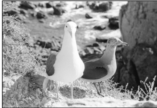
Figure 1. Healthy gull

Botulism is a paralytic, often fatal disease of birds resulting from the ingestion of a toxin produced by the bacterium Clostridium botulinum . Sporadic die-offs of fish eating birds such as gulls and loons are usually caused by type E toxin and are common to the Great Lakes. Type C toxin also affects waterfowl, but is more commonly responsible for duck die offs in the western United States.