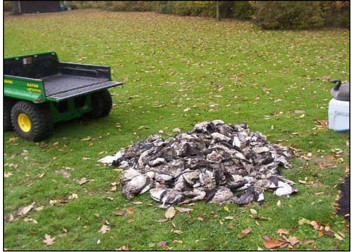
Figure 5. Removal of carcasses