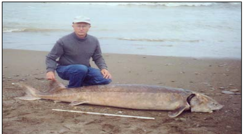
Figure 6. Dead sturgeon

Field investigations have suggested that the die-offs observed in Lake Erie may be the result of botulism type E poisoning. Species commonly found during die-off events include: Freshwater Drum (Sheepshead), Smallmouth Bass, Rock Bass, Stonecats, Round Gobies, Sturgeon, and Channel Catfish. It is suspected that zebra and quagga mussels are ingesting the botulinum bacteria (invertebrates are not affected by botulism). Round gobies are known to heavily feed on mussels; therefore, they are thought to be ingesting the bacteria. Native fish species such as those commonly associated with the die-off are starting to feed primarily on the round